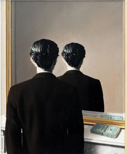
Figure V.86-3. Magritte (1937), La reproduction interdite . Museum Boijmans Van Beuningen, Rotterdam, The Netherlands. As well as the anomalous reflection of the subject's back, the reflection should be rotated slightly, not seen square on. In this and many other artistic examples (e.g., Manet's Le Bar aux Folies-Bergère ), the freedom with which the artist has created the reflection is not obvious until pointed out. (Image used under academic fair use.)

reflections, sometimes using impossible reflections, without the image immediately looking wrong. Even in extreme examples, like Magritte's painting La Reproduction interdite (Figure V.86-3), it takes us a moment to identify, if indeed we do at all, the several things wrong with the image.